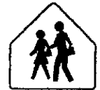
School Crossing Ahead

School Crossings and School Zones: School crossings and zones are usually posted along with the speed limit.