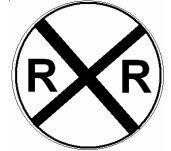
RAILROAD WARNING SIGN